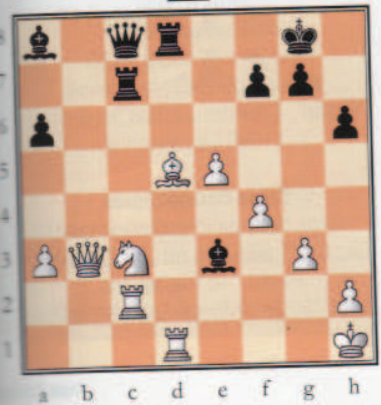
Tiercé gagnant !