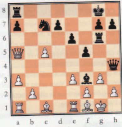
...et enfin la D122 !