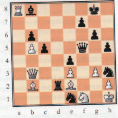
Un peu de calcul