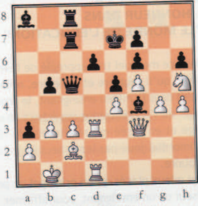
Percée irrésistible !