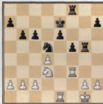
Vachier-Lagrave,M (2412) - Muheim,L (2142) Ch Monde, G14, Halkidiki