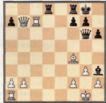
Tjurins,I (2202) - Bellaiche,A (2454) Ch Monde, G16, Halkidiki