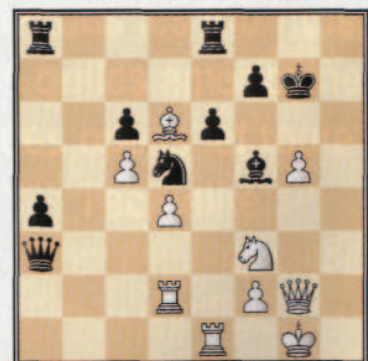
Terrieux,K (2253) - Pakleza (2345) Ch Monde, G18, Halkidiki